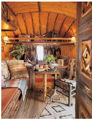
Interior of Adirondack Airstream